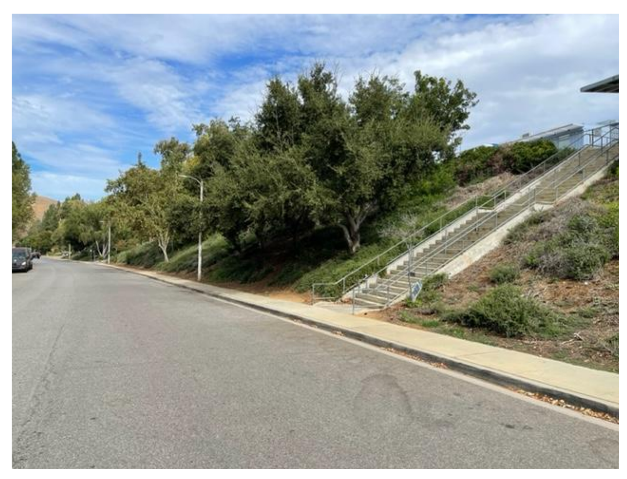
2. Stairs located on Hollytree Drive - Alternate Morning/Afternoon Drop off & Pick up zone.