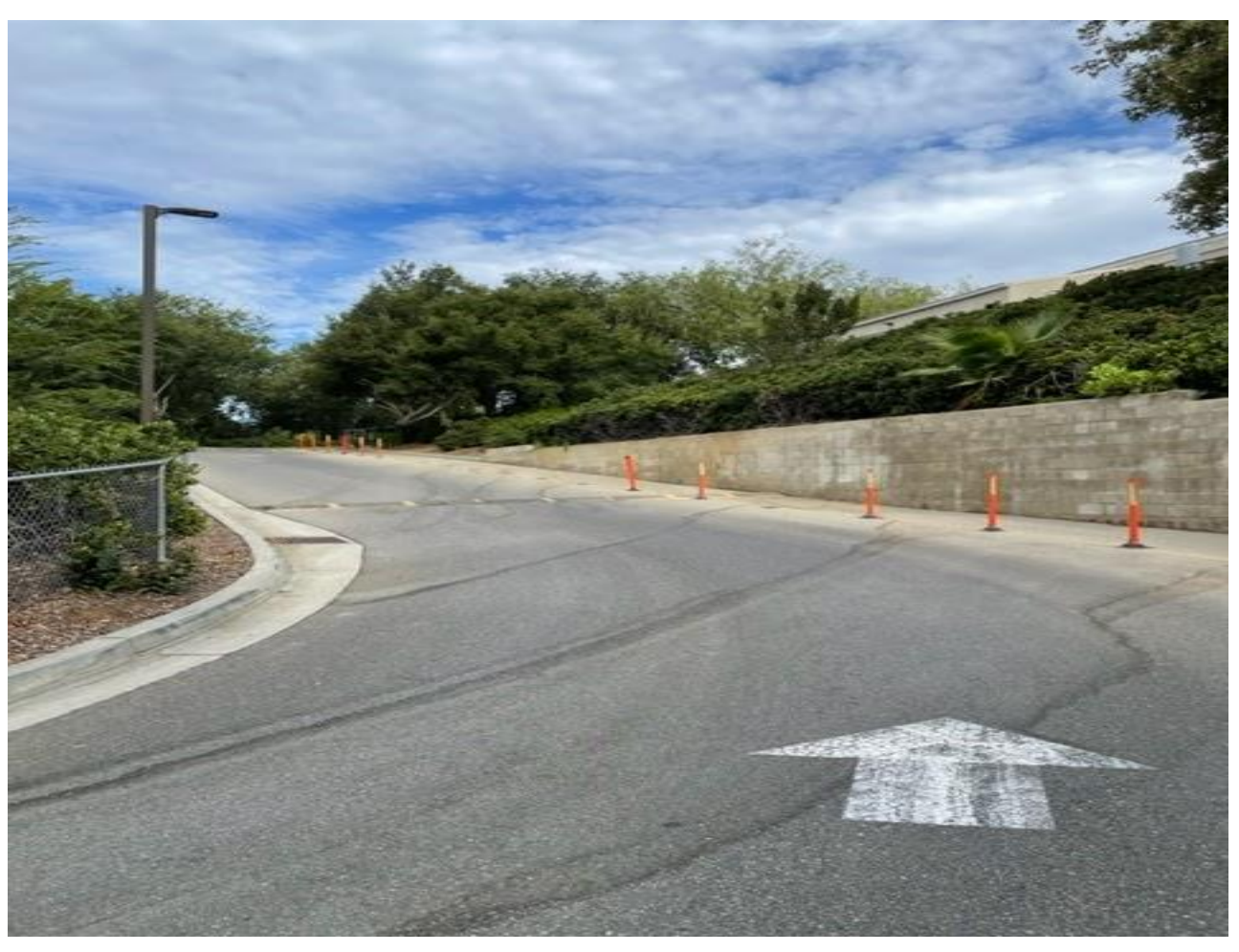
Uphill driveway when entering Medea Creek Middle School from Hollytree Drive.