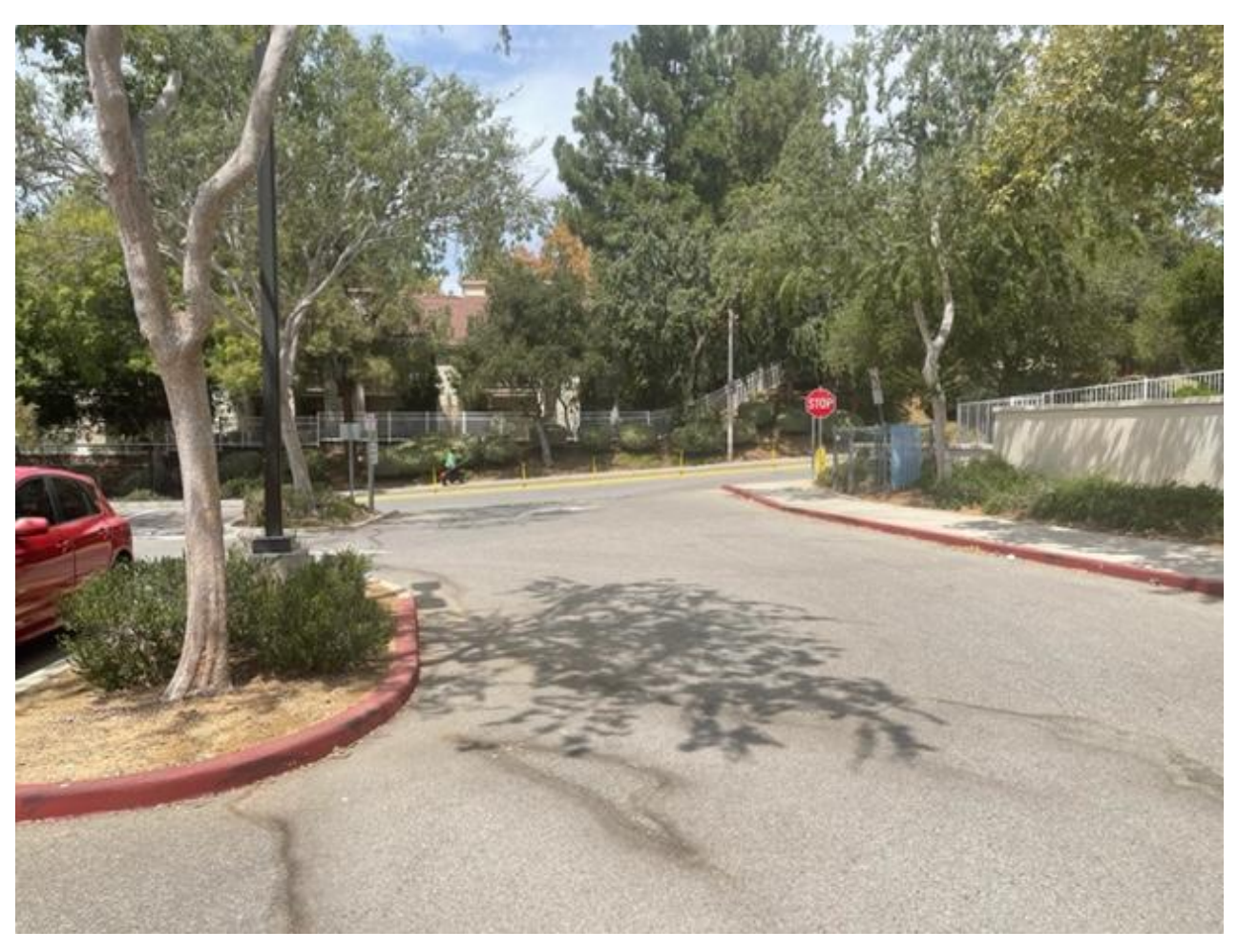
School Exit (Right turn <u>ONLY</u>) leading to the Doubletree Road.