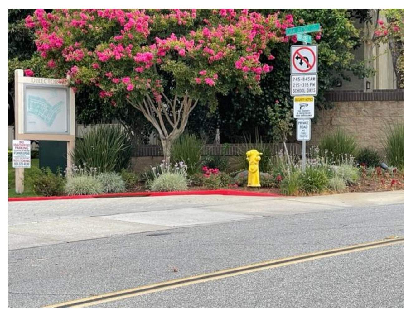
ShadowRidge Condos entrance across from campus exit. No U-Turns allowed from 7:45-8:45 AM and 2:15-3:15 PM on School days.