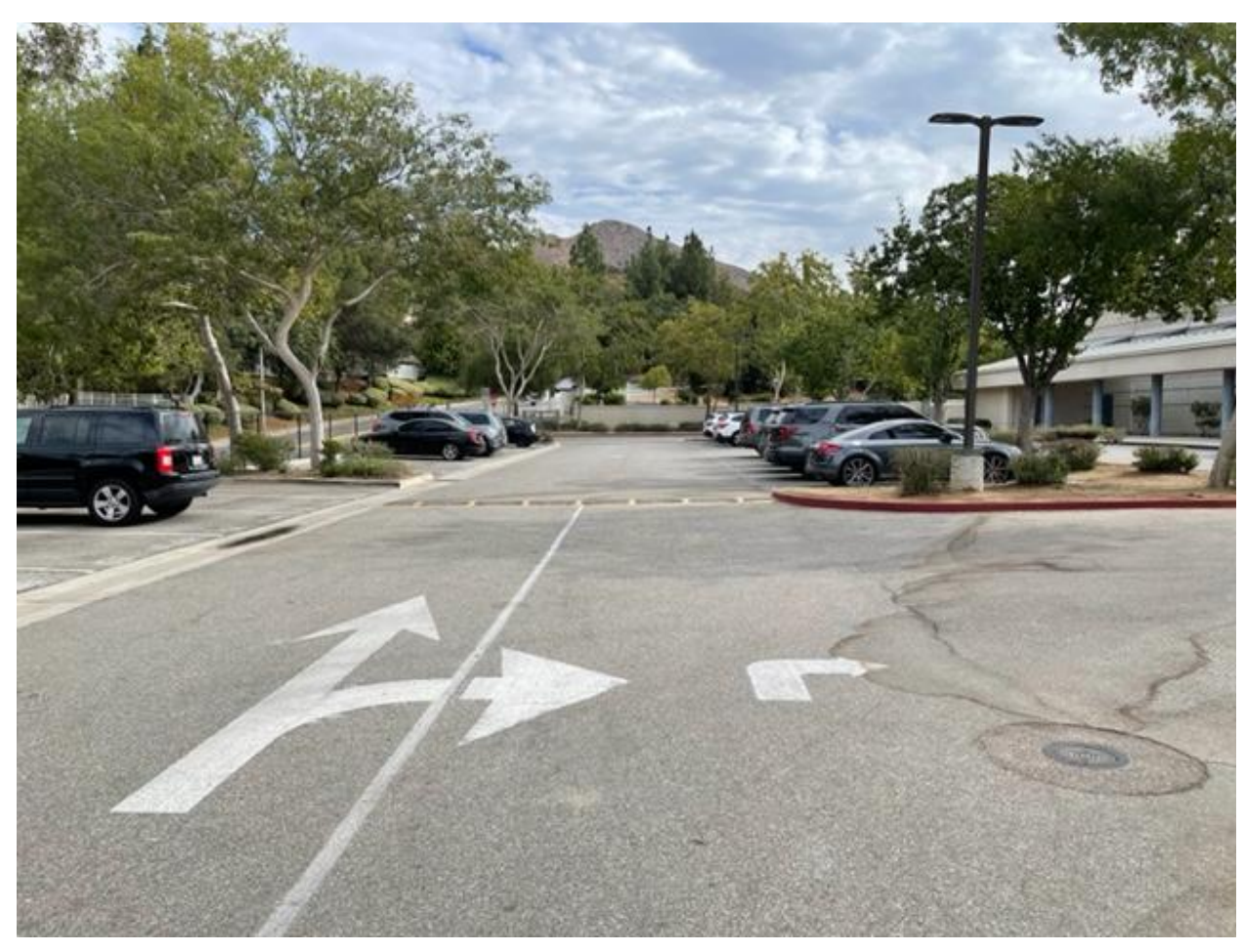
Straight arrow for thru-traffic single lane <u>ONLY.</u> Right arrow to Flagpole morning/afternoon drop off / pick up.