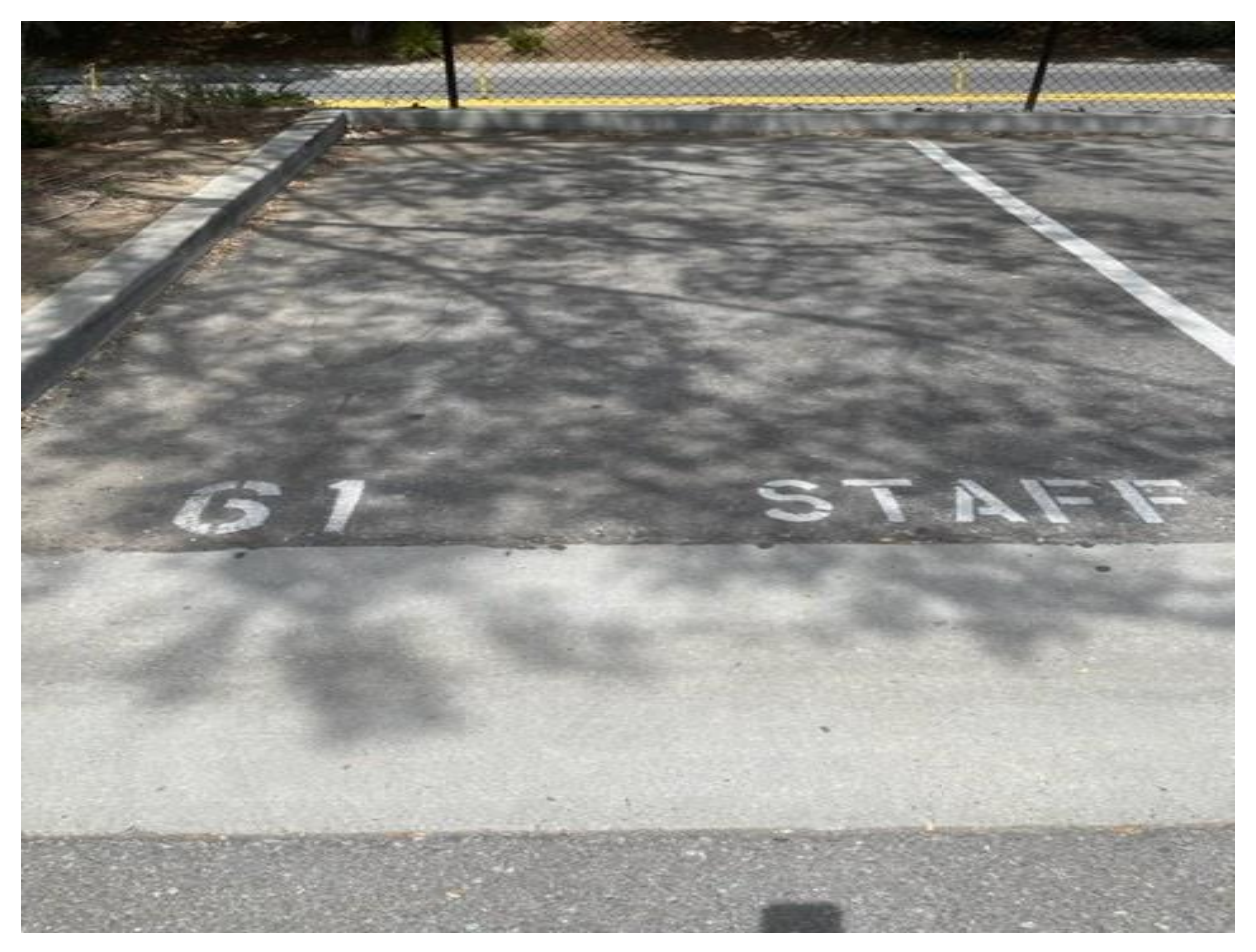
Numbered staff parking spaces. Please <u>DO NOT</u> park in these spaces.