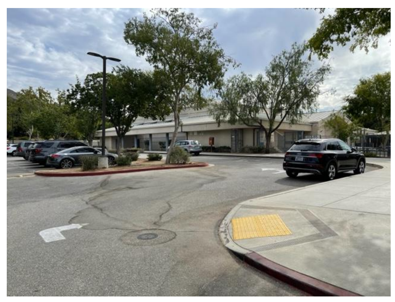
Flagpole morning/afternoon drop off / pick up.